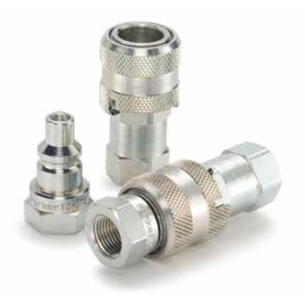
TC Series (3/8") Test Fluid: Oil - 200 SUS